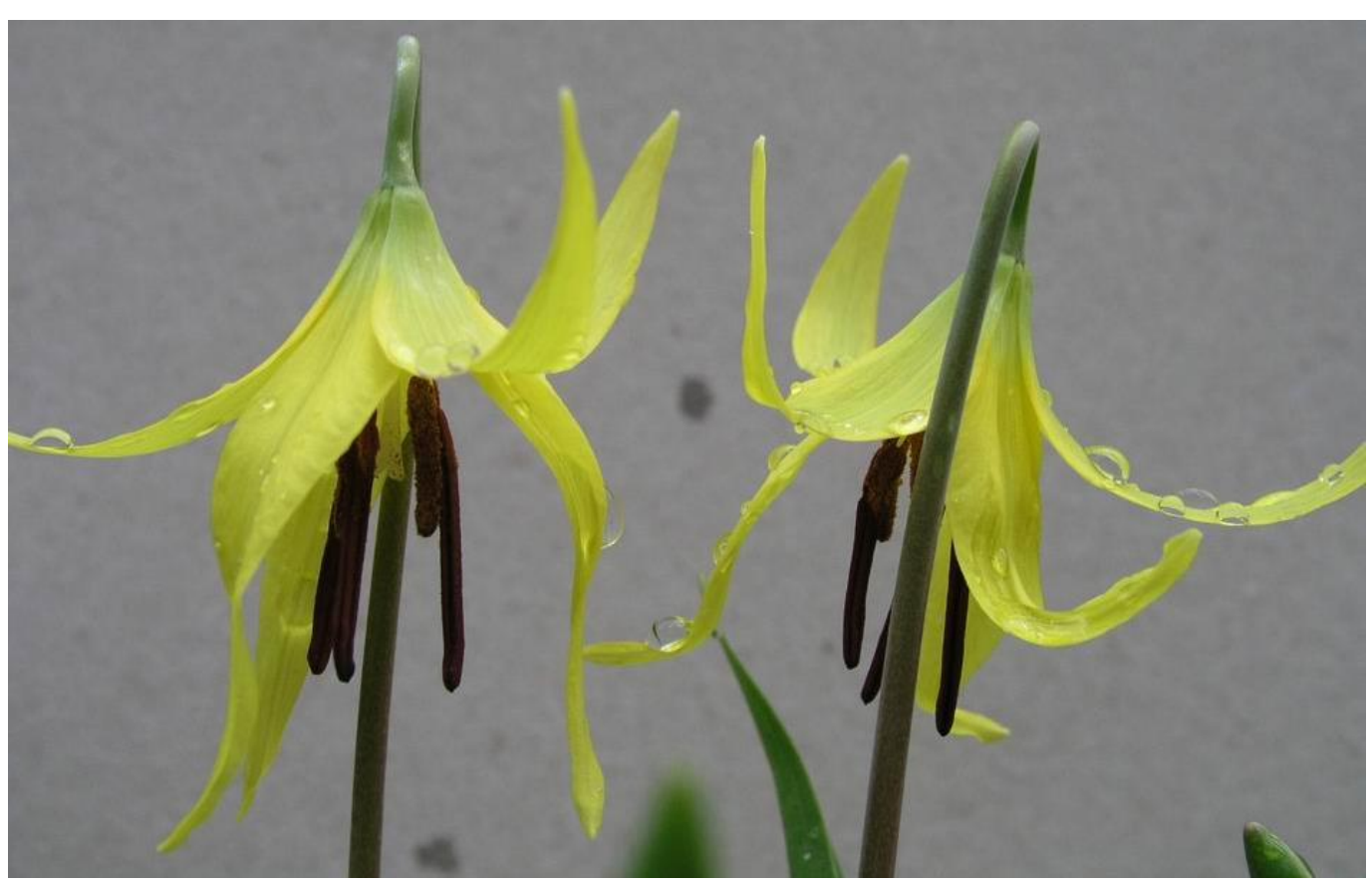
Erythronium grandiflorum var. grandiflorum