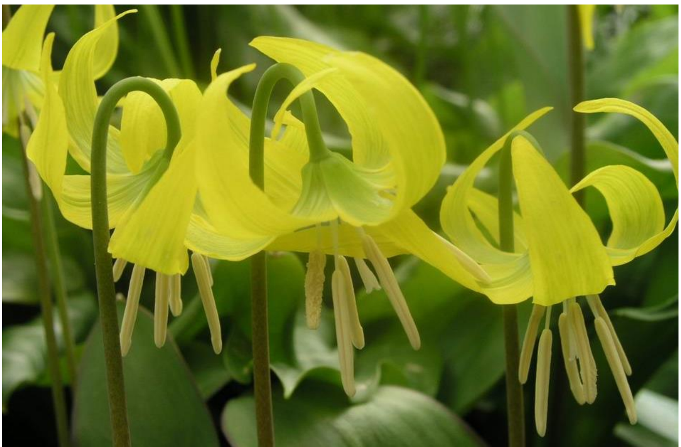
Erythronium grandiflorum var. pallidum