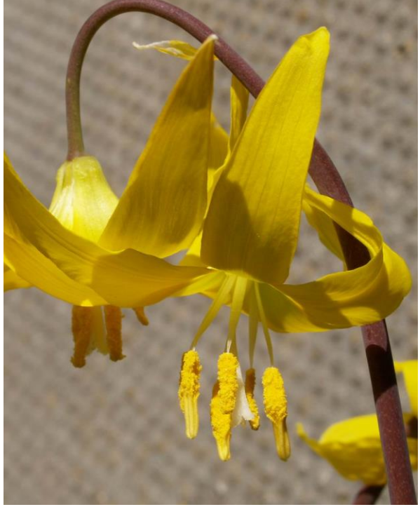
Erythronium grandiflorum var. chrysandrum

Three varieties are named depending on the colour of the anthers; var. grandiflorum has brown pollen, var. chrysandrum, yellow and var. pallidum, cream.