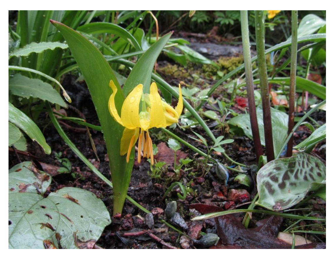
Shown on the left is Erythronium grandiflorum var. chrysandrum growing in the rock garden and below is a mixed group growing in a sand bed.