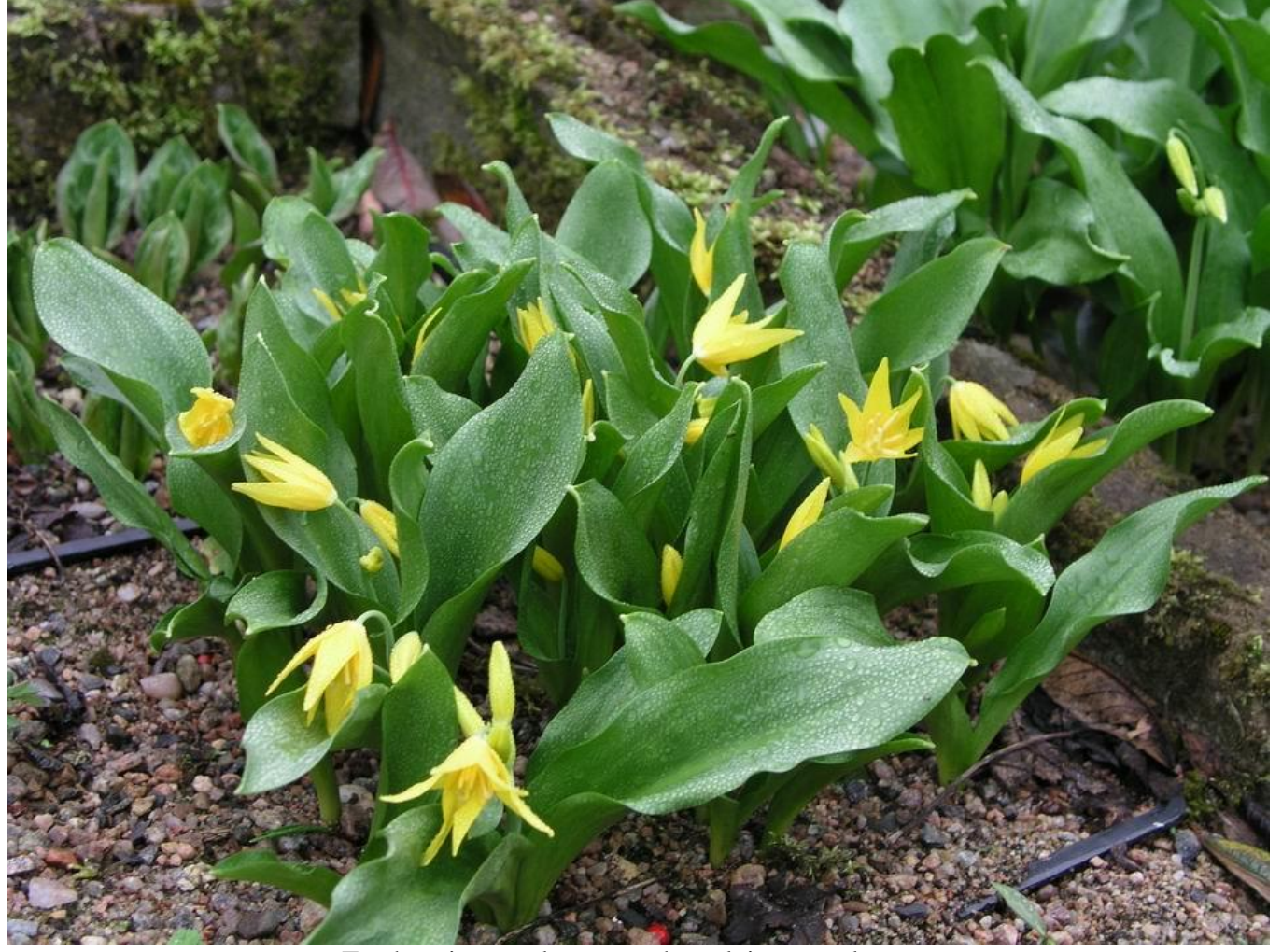
Erythronium tuolumnense has plain green leaves.