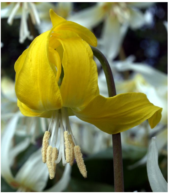
Erythronium grandiflorum var. pallidum