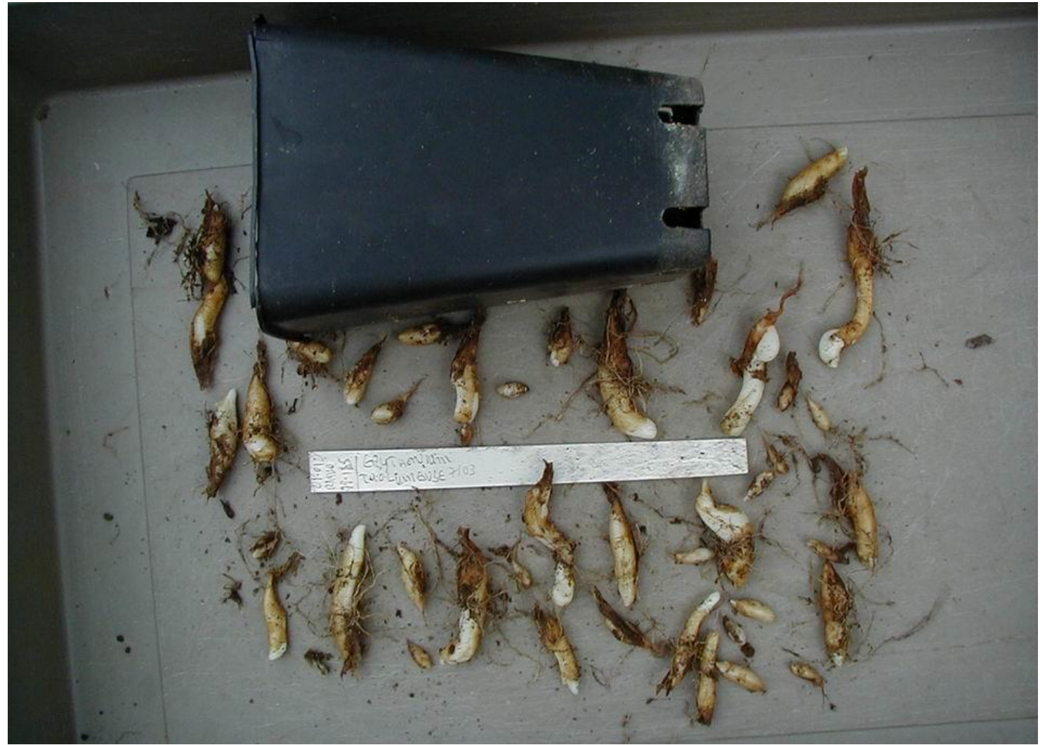
Erythronium tuolumnense seedling bulbs being repotted for the first time three years after sowing.